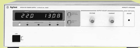
6010A, 6011A, 6012B, 6015A